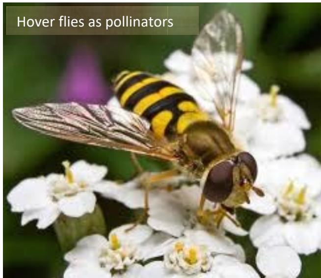
Hover flies as pollinators